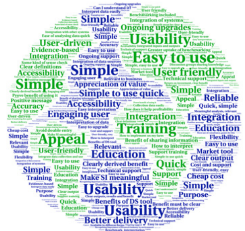
Delegates' priorities for the delivery of effective decision support tools for SI

In the afternoon, software manufacturers of commonly used systems in the UK were asked to tell the group about the design process of their product, and how they tailored each to the needs of their end users. The workshop finished with an interesting discussion, looking specifically about how we could get products used more often by farmers and consultants to improve decision-making for sustainable intensification. The word cloud below is a collection of words written on a set of sticky notes by delegates outlining the key priorities for decision support design and delivery. Results from this workshop will help to inform the development of a set of key characteristics of decision support tools.