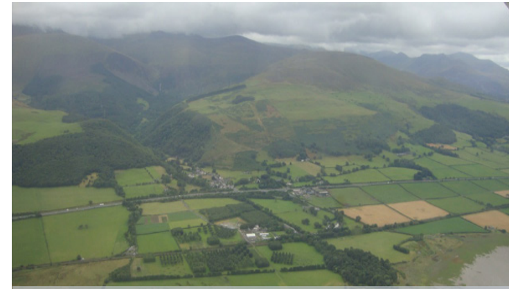
Henfaes transects from amongst the highest altitude agricultural land in Wales, down to sea level; offering a unique study site for both upland and lowland systems

SIP has direct relevance to farmers in Conwy, since it looks at optimising grassland management and how to facilitate collaboration, both of which have potential to enhance the resilience of farmers in Conwy and those in other similar regions across the UK.